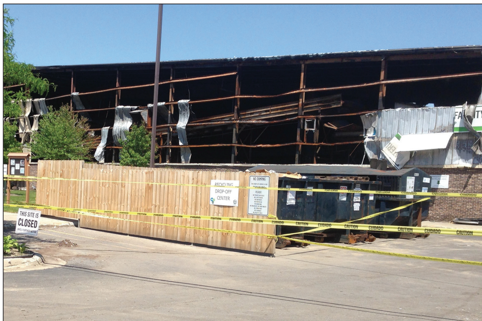
Repairs to the RRRASOC facility began last December, and it is expected to be running again in spring 2016.

The existence of a public-private partnership has been a definite advantage in this situation, with the pact between RRRASOC and ReCommunity bringing resiliency and opportunity. The MRF was able to move material to other locations. At the same time, employees were given the opportunity to relocate to another ReCommunity location during the investigation and rebuild. This meant that workers might have had to travel further than their normal commute