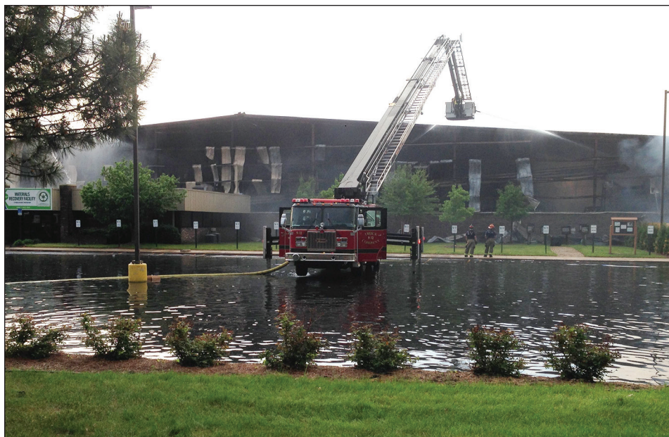
The fire department was on the scene for four days dealing with smoldering material and other complexities.

After the immediate situation had settled, it was time to evaluate what resources were going to be needed to recover from the fire. Soon after the event, Csapo went to the RRRASOC board and asked for additional funding to hire the qualified