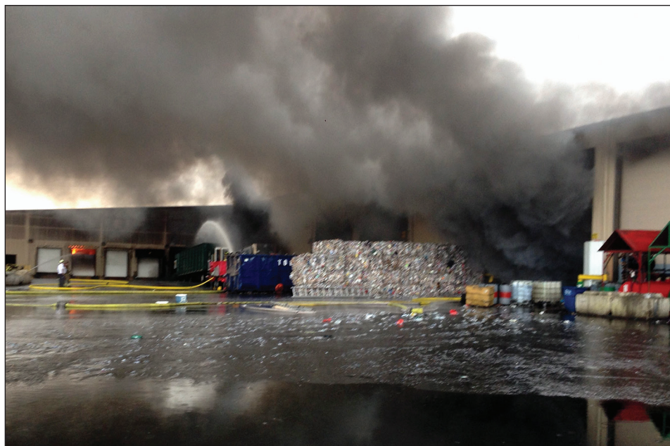
The RRRASOC fire shut down a facility that processed 60,000 tons a year.

Still, although many standard operating procedures (SOPs) were previously established and performed well in the situation, some instances required on-the-spot expertise. The fire department was on the scene for four days dealing with smoldering material and hotspots. This was partly because the MRF had loose material on the tip floor and on conveyor belts. The conveyor belts themselves, if not made of steel, were flammable. Bales of material didn't stop burning by pouring water on them – the bales need-